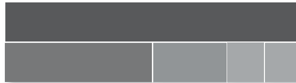
Fraction Strip #1