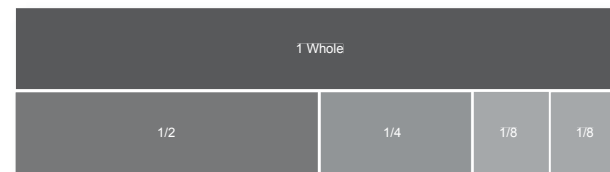
Fraction Strip #1